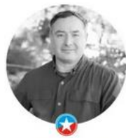
Eugene Vindman U.S. Army

Look, there's Abigail Spanberger of the CIA and Eugene Vindman.