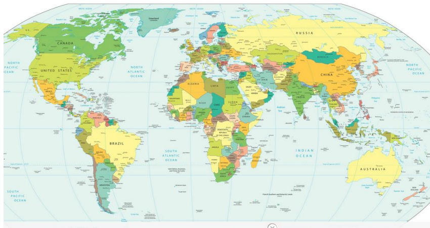
The Fucked-Up Map from British Empire's Perspective The Freaking dot of the British Isles - Centre of the World

We need not go further than to understand the Map of the World as Trump has been brainwashed to follow only the Map below !