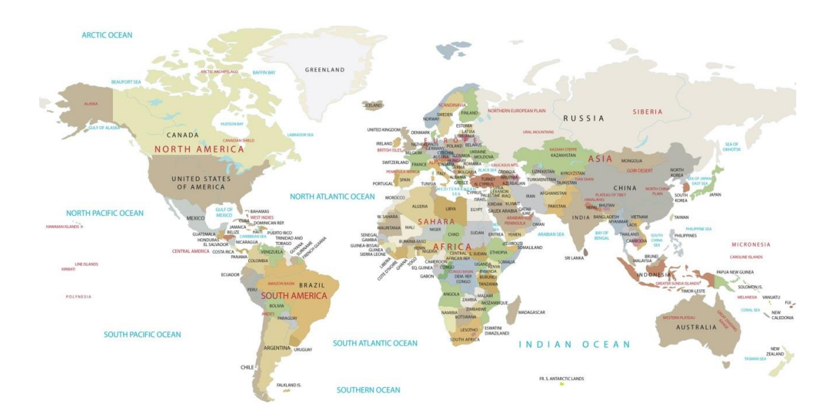
MAP 1 - Freaking arseholes – this is the freaking map you are familiar with. You are fucked up because you cannot see and did not see the world map from any other perspective!

Contrast with what Matthias Chang sees in Map 2 besides the above Map 1.