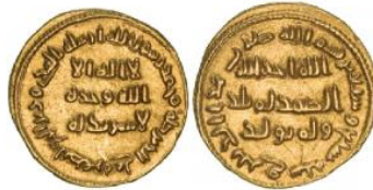
Umayyad (second) Islamic caliphate (661-750AD) Dated 89h (708 AD) In 77 H (696 AD) 'Abd al-Malik introduced the gold dinar the first true Islamic coin because anyone who had a Byzantine gold coin must exchange them or be executed. Probably struck in Damascus, the Umayyad capital.