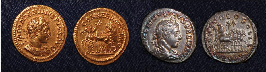
Elagabalus (218-222AD) Stone of Emesa (Black Meteorite)

Of course, we have the rise of Christianity. While Nero (54-68AD) blamed the Christians for setting the Great Fire of 64AD, that is at least understandable since many were blaming him, and he needed a scapegoat. It was not really a persecution due to their religion. It is just the Christians refused to respect the religion of anyone else, which made them outsiders and radicals.