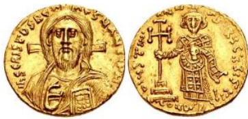
Byzantine Emperor Justinian II (First reign, 685-695) AV Solidus (20mm, 4.46 grams) Constantinople mint, 10th officina. Struck 692-695AD

Arabs were forced to create their own currency