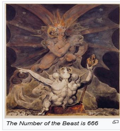
The Number of the Beast is 666