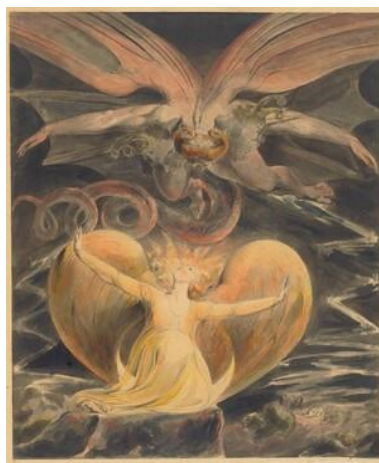
"The Great Red Dragon and the Woman Clothed with the Sun"

His work's originality and sometimes graphic content as well as the eccentricity of his character led some of Blake's peers to question his sanity and mental stability, according to contemporaneous accounts. The artist had visions of angels or spirits, the first of which occurred at age 10 when he saw "a tree filled with angels, bright angelic wings bespangling every bough like stars." Such experiences were a source of inspiration for the artist and he recorded them in letters and writings.