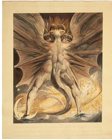
Red Dragon with 7 heads and ten horns