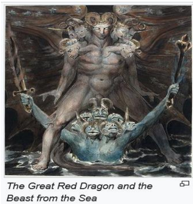
The Great Red Dragon and the Beast from the Sea