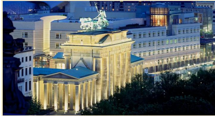
The vast US embassy in Berlin lurks by iconic Brandenburg Gate

This unacknowledged reality is amply spelled out in Agency whistleblower Philip Agee's 1978 tell-all book , Dirty Work: The CIA in Western Europe . Comprehending who is truly in charge in Berlin, and what interests Germany's elected representatives are actually serving, is fundamental to understanding why Scholz, et al., so eagerly embraced the self-destructive sanctions. And why the facts of Nord Stream 2's criminal destruction can never emerge.