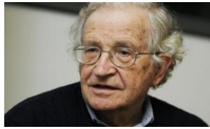
Noam Chomsky

invasion is the result of “the barking of NATO at the gates of Russia.... I can’t say if it was provoked, but perhaps, yes.”