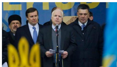
Then US Senator John McCain center speaks as Chris Murphy Democratic senator from Connecticut second left and Opposition leader Oleh Tyahnybok right stand around him during a pro European Union rally in Independence Square in Kyiv Ukraine in December 2015

The 2013-2014 anti-government protests, which started out peacefully in Kyiv's Maidan (square), was urged on by visits to the streets by the U.S. undersecretary of state and regime change specialist, Victoria Nuland, who repeatedly met with coup plotters. Joining her were Senators John McCain (R-AZ) and Chris Murphy (D-CT), who stood on a platform in the square with the neo-Nazi leader Oleh Tyahnybok to offer America's support, presumably without formal authorization, for the illegal overthrow of Yanukovych.