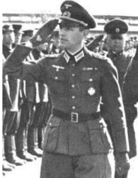
Reinhard Gehlen

During the war, Lebed was said to have been a good pupil and favorite of the German Gestapo. Afterwards, relocated in Munich, Lebed enjoyed the patronage (as did Bandera) of Nazi intelligence officer Reinhard Gehlen, who himself had close operational relations with the CIA.