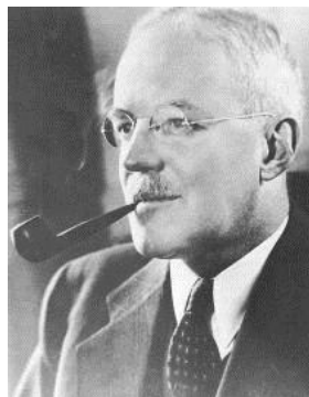
Allen Dulles