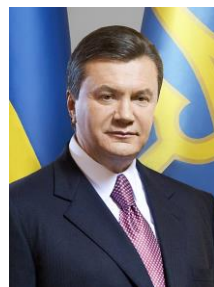
Viktor Yanukovych

The 2013-2014 anti-government protests, which started out peacefully in Kyiv's Maidan (square), was urged on by visits to the streets by the U.S. undersecretary of state and regime change specialist, Victoria Nuland, who repeatedly met with coup plotters. Joining her were Senators John McCain (R-AZ) and Chris Murphy (D-CT), who stood on a platform in the square with the neo-Nazi leader Oleh Tyahnybok to offer America's support, presumably without formal authorization, for the illegal overthrow of Yanukovych.