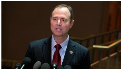
Adam Schiff

We fight Russia over there so we don't have to fight them here.