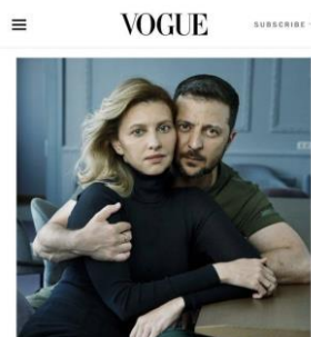
A president under siege The Zelenskys on the cover of <i>Vogue</i> magazine

The deluge of MSM propaganda against Russia and the embargo of voices that question the official story regarding the 2014 coup and the Russia-Ukraine conflict expose U.S. democracy as a model not worthy of emulation. There are few if any authoritarian states where suppression of news is of such magnitude and so institutionally entrenched as in the U.S. Elsewhere , I have discussed the wide presence of former military and intelligence officials with ties to defense industries populating the broadcast and cable news channels as “expert analysts,” and the uses of white supremacist ideology by MSM reporters to depict displaced Ukrainians as a special group of “worthy victims.” A central feature of the MSM reporting and celebrity culture has been the portrayal of Zelensky as a “hero,” selflessly defending Ukraine against tyranny. The hero image in America is an old trope taken from a long line of such larger-than-life military exemplars that include John Wayne’s characters in World War II, the construction of the Vietnam war criminal into “war hero” John McCain, the chicken hawk Ronald Reagan, Rambo , the Indian killer Daniel Boone, and so many others