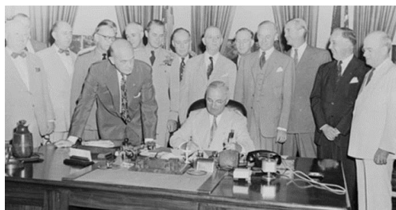
President Harry S Truman signing off on creation of the CIA

The immediate target was Soviet Ukraine, which the CIA hoped through its clandestine projects to “crack apart” with saboteurs behind enemy lines.