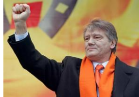
Viktor Yushchenko

With U.S. help, Yushchenko prevailed but failed miserably as president. The fire alarm went off again for the U.S. in 2010, when Yanukovych was elected president. By then, Yushchenko was fully discredited as a leader, receiving only 5.5% of the first-round vote, thereby eliminating him. The U.S. has had a hard time picking winners.