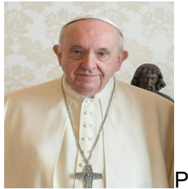
Pope Francis

The deluge of MSM propaganda against Russia and the embargo of voices that question the official story regarding the 2014 coup and the Russia-Ukraine conflict expose U.S. democracy as a model not worthy of emulation. There are few if any authoritarian states where suppression of news is of such magnitude and so institutionally entrenched as in the U.S. Elsewhere , I have discussed the wide presence of former military and intelligence officials with ties to defense industries populating the broadcast and cable news channels as “expert analysts,” and the uses of white supremacist ideology by MSM reporters to depict displaced Ukrainians as a special group of “worthy victims.” A central feature of the MSM reporting and celebrity culture has been the portrayal of Zelensky as a “hero,” selflessly defending Ukraine against tyranny. The hero image in America is an old trope taken from a long line of such larger-than-life military exemplars that include John Wayne’s characters in World War II, the construction of the Vietnam war criminal into “war hero” John McCain, the chicken hawk Ronald Reagan, Rambo , the Indian killer Daniel Boone, and so many others