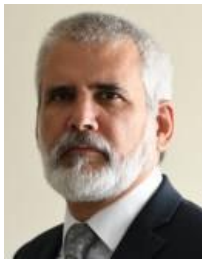
Dr. Robert W. Malone , gene therapy, bio-defense, vaccines and immunology; discoverer of in-vitro and in-vivo RNA transfection and architect of mRNA vaccine platform