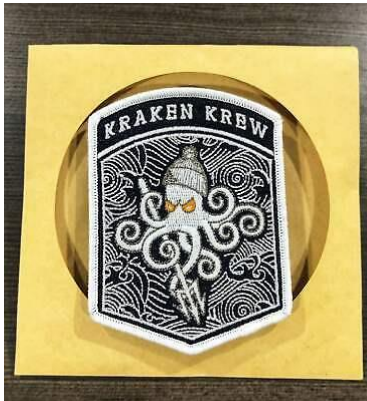
Kraken Krew Flash V2 Morale Patch Prometheus Design

The entire video can be viewed at this link: The Great Reset: The Deep State vs the Great Awakening – YouTube