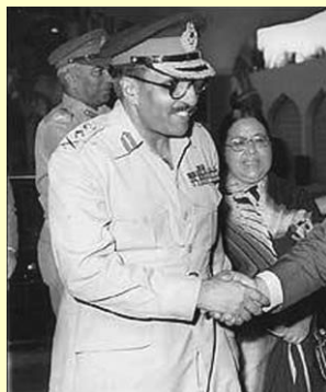
Zia ul-Haq, military dictator of Pakistan, 1977-1988.

The head of Saudi intelligence at that time was Prince Turki, the cousin of Prince Bandar, who was the Saudi ambassador to the U.S. from 1983 to 2005, and a close personal friend of both Bush presidents. Bandar and his wife funded several of the terrorists who ran the 9/11 attacks on the United States. It was Turki who personally sent Osama bin Laden, a member of the family running the largest construction company in Saudi Arabia, to Afghanistan when the Russians deployed their military into the country. Bin Laden stayed in Afghanistan until near the end of the war.