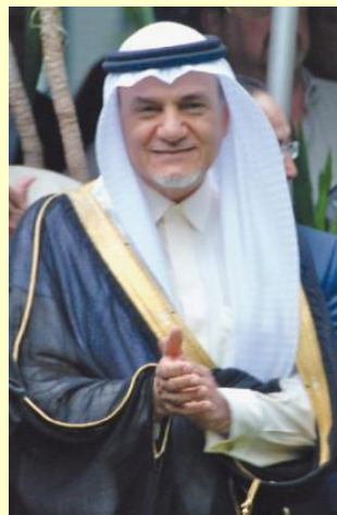
Prince Turki bin Faisal Al Saud, director of Saudi Arabia’s General Intelligence (1979-2001) and Ambassador to the U.S. (2005-2007).

This then brings us to 9/11. Soon after George W. Bush was inaugurated President in 2001, along with Dick Cheney who had chosen himself to be Vice President, Lyndon LaRouche warned that there would soon be a “Reichstag Fire” in Washington or elsewhere in the U.S. As with the original Reichstag Fire, which was set by the Nazis but blamed on “communists” and used as justification for imposing a dictatorship and police-state rule, LaRouche warned that such an event in the U.S. would be used by the neoconservative Bush government to impose police state measures and to launch colonial wars with our “blood brothers” in the UK.