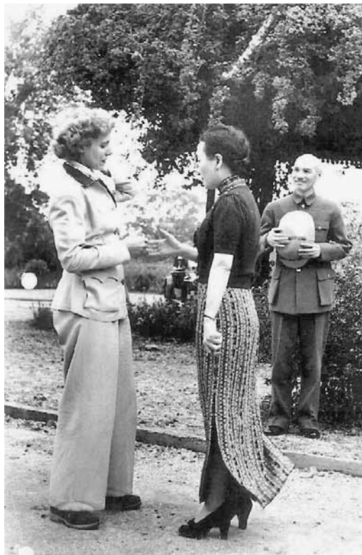
Gen. Chiang Kai-shek and Madame Chiang greet Clare Boothe Luce in April 1942.