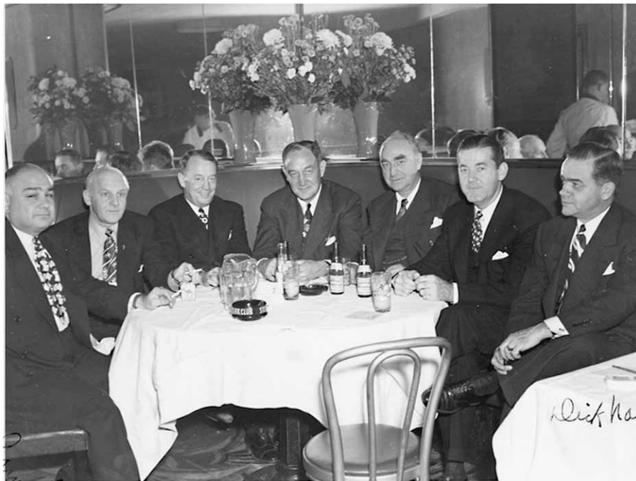
Harry S. Truman Presidential Library

I have been associated with Henry Wallace during his past four years as Vice President, for eight years earlier while he was Secretary of Agriculture and well before that. I like him and respect him and he is my personal friend. For those reasons, I personally would vote for his re-nomination if I were a delegate to the Convention. At the same time, I do not wish to appear in any way as dictating to the Convention. Obviously the Convention must do the deciding.