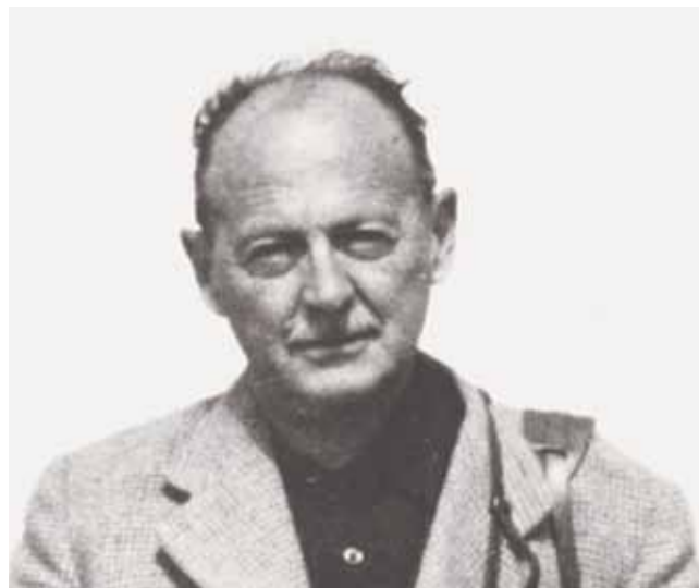
Smithsonian Institution Archives

I believed in the creation of a new nation of the English-Speaking Peoples by dual citizenship. Canada, America, Britain, Australia and New Zealand [that is, the future "Five Eyes"] would form the nation of Canambria, and each citizen, as in the U.S., would become a dual citizen 19 . . . . The immediate effect would be the welding of the British and American battle fleets into one permanent world navy, thus evolving the Pax Britannia into the Pax Canambria. This had to be done because it was apparent that Brit-