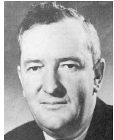
Sir Stewart Menzies, Chief of MI6 (1939-1952) (left); and Canadian Sir William Stephenson (code name Intrepid), senior representative of British Security Coordination for the western hemisphere during World War II.