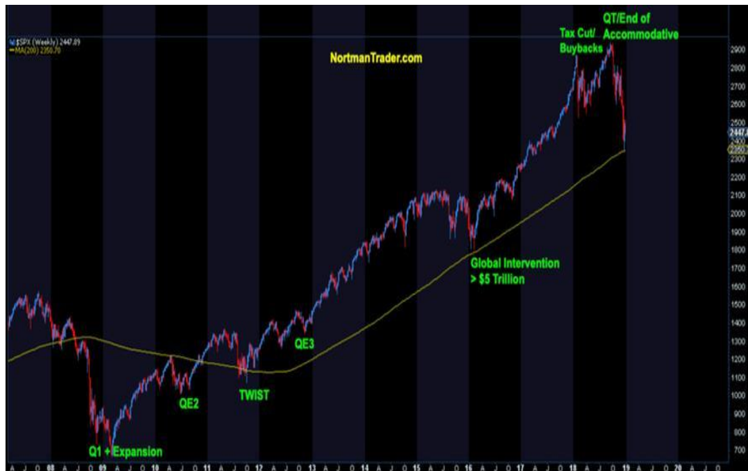
Exhibit E: The prosecution presents a full picture of all central-bank stock salvation:

The Fed may claim that it does not attempt to rescue markets and that it looks only at economic indicators, yet somehow every time the market took a major plunge in the graph above, the Fed was instantly on the scene with a new invention of monetary stimulus in massive doses. Of course, “correlation is not causation.” Correlation is pretty interesting, though, especially when it happens at every plunge, except the one at the top that is plunging much further than any other time on this graph ... because one thing IS different: No one is stepping in with salvation this time.