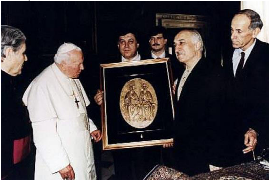
Gülen and the late Pope John Paul II in Rome in 1998, posing as a man of peace and ecumenical harmony.

Unlike the CIA’s Mujahideen Jihadists, like Hekmatyar in Afghanistan or Naser Orić in Bosnia, the CIA decided to give Fethullah Gülen a radically different image. No blood-curdling, head-severing, human-heart-eating Jihadist, Fethullah Gülen was presented to the world as a man of “peace, love and brotherhood,” even managing to grab a photo op with Pope John Paul II, which Gülen featured prominently on his website.