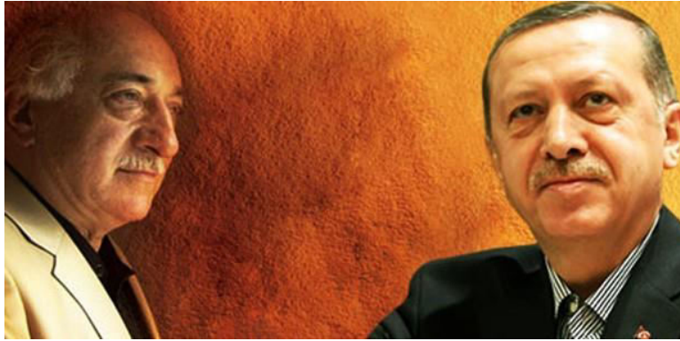
Until an open clash in 2013, Fetullah Gülen (left) was the éminence grise behind Recep Erdoğan's AK Party; Gülen is widely branded in Turkey as a CIA asset.

However, over the objections of the FBI, of the US State Department, and of the US Department of Homeland Security, three former CIA operatives intervened and managed to secure a Green Card and permanent US residency for Gülen. In their court argument opposing the Visa, US State Department attorneys had notably argued, "Because of the large amount of money that Gülen's movement uses to finance his projects, there are claims that he has secret agreements with Saudi Arabia, Iran, and Turkic governments. There are suspicions that the CIA is a co-payer in financing these projects." xiv