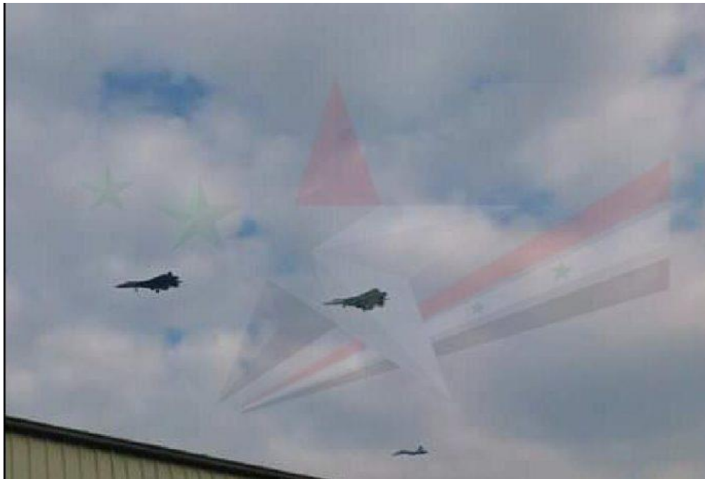
Feared Russian Su-57 PAK-FA “Nuclear Strike” Stealth Fighters (top two aircraft) arrive in Syria on 22 February 2018

A gravely worded new Ministry of Defense (MoD) report circulating in the Kremlin today states that President Putin has authorized the immediate deployment to Syria of at least two fearsome Su-57 PAK-FA “Nuclear Strike” Stealth Fighters in response to the United States refusal to heed Russia’s warning to leave this region —and with the Americans not only refusing to leave Syria , but their then, after receiving this warning, discovered to be evacuating Islamic State (ISIS/IS/Daesh) commanders from their prison cells by helicopter then flying them to the Eastern Ghouta (suburb of Damascus under terrorist control) combat zone where less than 24 hours ago, they unleashed a massive shelling attack against the Russian Reconciliation Center .