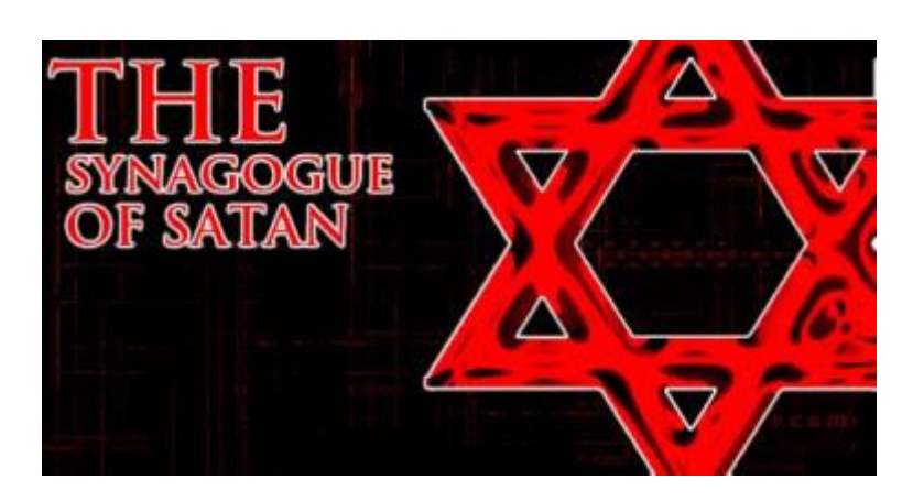
PART I – UNDERSTANDING THE TRUE NATURE OF JUDAISM AND HOW IT WORKS

Civilization is defined as the process by which a society reaches an advanced stage of social development, cooperation, and organization. In this manner, one cannot understand civilization without first factoring into it the issue of religion. All civilizations that have emerged on Earth from the beginning of human history have had a spiritual foundation, regardless of