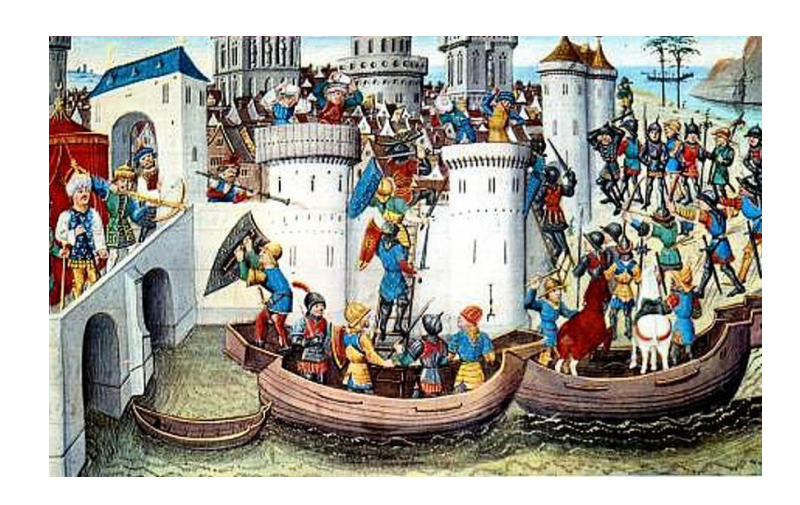
THE IVth CRUSADE

We shall give here only a few examples to argue our point: