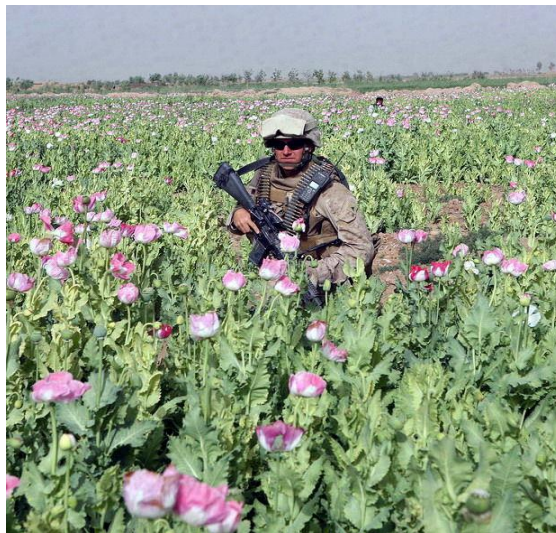
US Marines protecting CIA poppy fields in Afghanistan in 2017

An interesting Ministry of Foreign Affairs ( MoFA ) report circulating in the Kremlin today states that President Donald Trump has ordered instituted a “ Gordian Knot ” (name to a proverbial term for a problem solvable only by bold action) action for the Islamic Republic of Afghanistan based solely upon Russia’s peace plan for this failed nation —while at the same time he’s allowing his nations Central Intelligence Agency ( CIA ) to continue their multi-billion dollar opium-heroin scheme located there to keep operating indefinitely too .