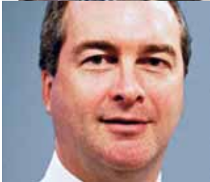
Robert Hannigan, adviser to the British Prime Minister.