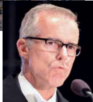
FBI deputy director Andrew McCabe.

information from Russians, which in this case is not very reliable; we have the use of all of this as a road-map for launching an investigation of the President of the United States after he was elected.