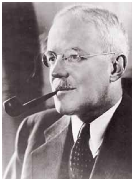
Former CIA director Allen Dulles.