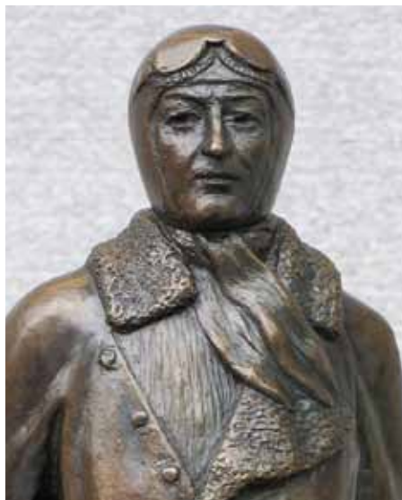
From a statue of Sir William Stephenson (code named Intrepid).

In 1946, the “British-U.S. Communication Agreement” was signed as a secret treaty. It was an agreement to have intelligence collaboration between the United States and the U.K. with respect to the Soviet Union and the East Bloc