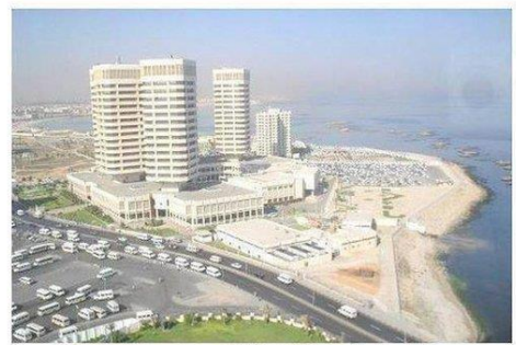
Libya with Gaddafi