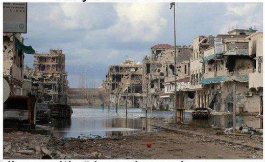
Libya with "American democracy"