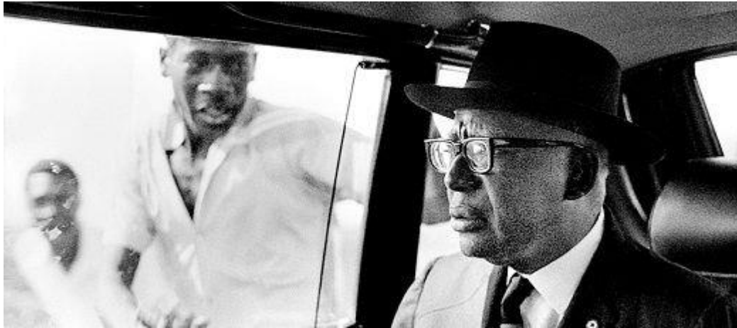
U.S.-backed dictator Francois Duvalier.