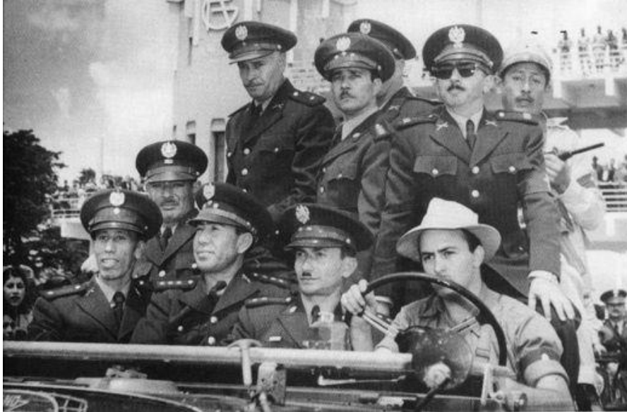
U.S.-backed and financed military tyrants of Guatemala 1954.

Under a series of military rulers after the coup, Guatemala suffered three decades of brutal repression in which as many as 200,000 people died, many of them campesinos killed by security forces.