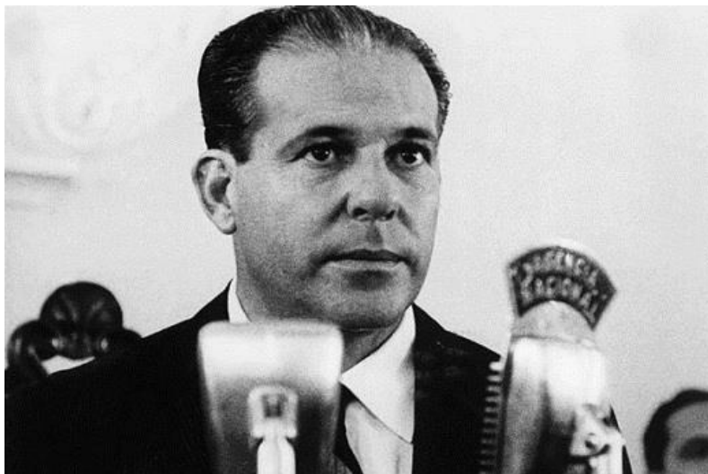
Joao Goulart's mistake was carving into U.S. companies' profits for the good of his people.

In 1964 a military coup ousted Goulart. Lincoln Gordon served as U.S. ambassador, playing a major role in support of the opposition against the government of Goulart and during the coup. On March 27, 1964, he wrote a top secret cable to the U.S. government, urging it to support the coup of Humberto de Alencar Castello Branco with a “clandestine delivery of arms” and shipments of gas and oil, to possibly be supplemented by CIA covert operations.