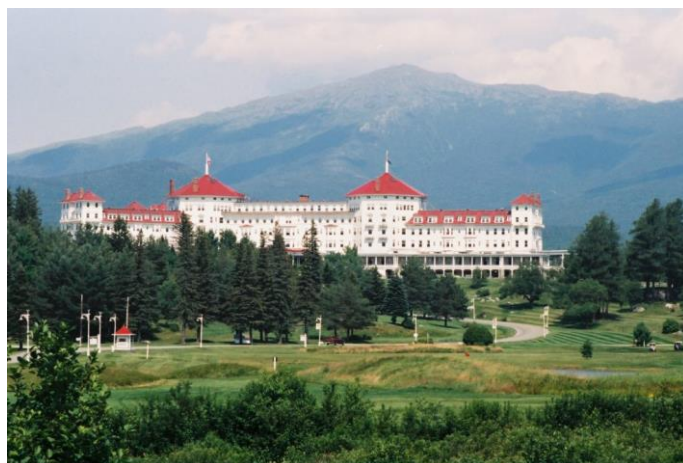
The Mount Washington Hotel in Bretton Woods, New Hampshire, where delegates from the Allied nations signed the 1944 Bretton Woods agreement establishing a system of global governance institutions.

In what follows, I first describe the foundations of the liberal order, and show that the ground on which it was built has been eroding for some time, though Trump's rhetoric and policies are also damaging. Next, I argue that for now the rising powers are not in a position to overturn the current order completely, and in fact they may wish to preserve some elements of it in the near and medium term. I describe a “multiplex world” in which elements of the liberal order survive, but are subsumed in a complex of multiple, crosscutting international orders. Finally, I offer some suggestions on how scholars and policymakers can manage the transition to such a multiplex world.