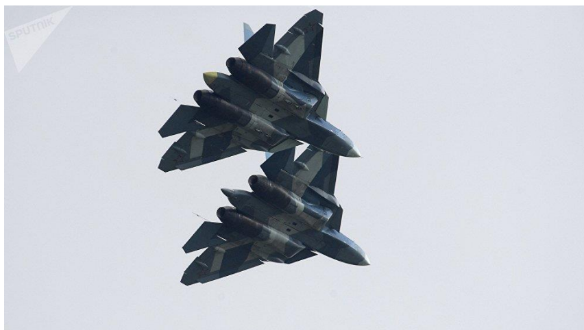
Feared Russian Su-57 PAK-FA “Nuclear Strike” Stealth Fighters begin arriving in Syria on 22-23 February 2018

Keeping the truth about what was happening from the American people, this report says, the “ Deep State ” used the nefarious actions of their terrorists to create an international Cause Célèbre —a controversial issue that attracts a great deal of public attention—decrying the loss of civilian life caused by Russian and Syrian forces actions to stop this needless bloodshed—but that President Putin, 3 days ago, quickly countered by ordering into the Syrian war zone for the first time two fearsome Su-57 PAK-FA “Nuclear Strike” Stealth Fighters —with his ordering another two of these dreaded warplanes to Syria on Friday .