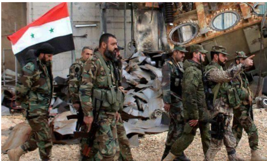
Elite Syrian Tiger Division forces begin major offensive to retake Eastern Ghouta from US-backed terrorists on 25 February 2018

With these US-backed “ Deep State ” terrorists in Eastern Ghouta now targeting hospitals in Damascus , but who are now not protected by Resolution 2401 , this report continues, just hours ago Syrian military forces began a major offensive, led by the elite Tiger Division against these terrorists—but with no major advances, as of yet, being reported .