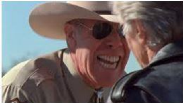
The US Approach: Bluster and Intimidation

The image below typifies how many countries outside the US see the US approach to diplomacy.