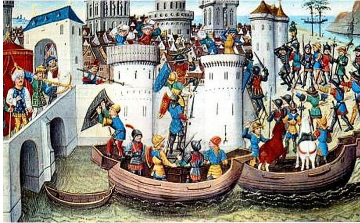
THE IVth CRUSADE

We shall give here only a few examples to argue our point: