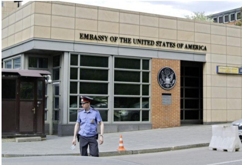
Russian FSB forces begin to surround American Embassy in Moscow on 31 July 2017

According to this report, in a retaliatory move against the United States this past week, the Security Council ordered the FSB to begin “ seizure proceedings ” against two US owned properties in the Moscow Oblast—one of which, a US diplomatic warehouse, was discovered to have in it a significant number of scientific and laboratory equipment whose “ purpose and usage ” has yet to be explained by the Americans.