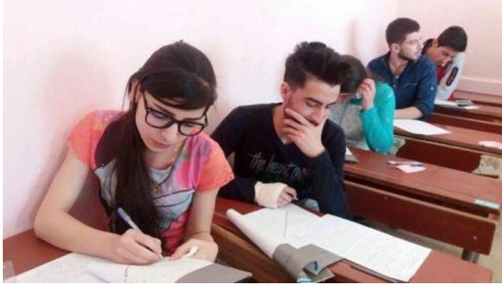
Final national exams just before summer 2017