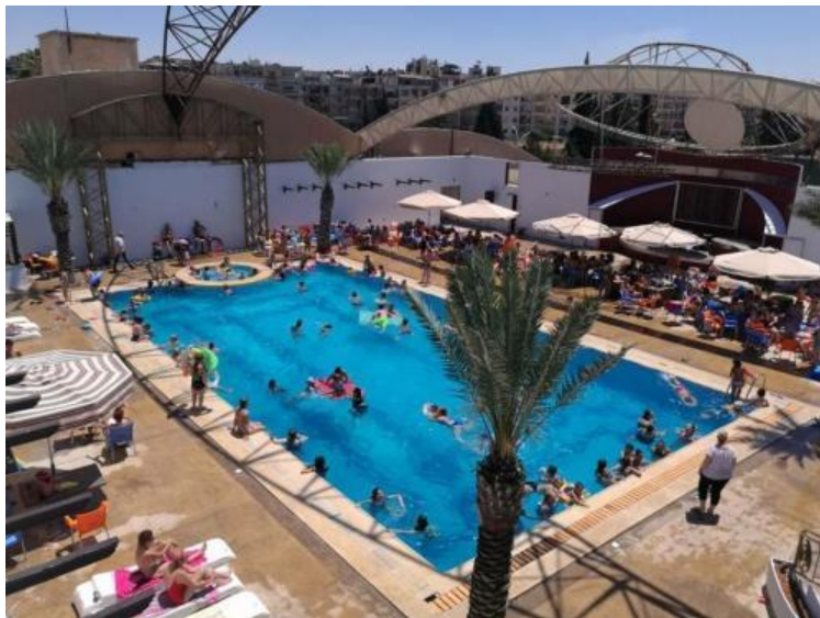
Andalusia Swimming Pool in Aleppo, Summer 2017

Aleppines didn't want to live under Wahhabi Islamist rule