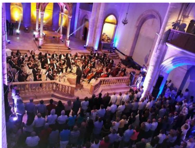
Aleppo orchestra concert, Summer 2017

Now, during the first summer of relative calm Aleppo residents have seen in over four years of grinding conflict, the city commonly referred as "the jewel of Syria" is once again rising from the ashes. Foreign journalists are also accessing places like East Aleppo and the heart of the walled 'old city' for the first time. Some few honest correspondents, unable to deny the local population's spirit of hopefulness and zeal with which they undertake rebuilding projects, acknowledge that stability and normalcy have returned only after the last jihadists were expelled by the Syrian government and its allies.