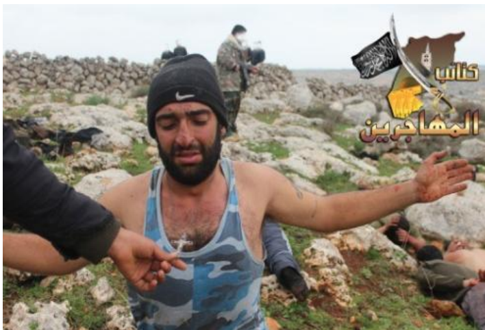
Image: "moderate" rebels mock a Christian government soldier—This photo was originally posted online by a Swedish based terror group in Syria after the Summer 2013 rebel offensive against the Menagh airbase near Aleppo. A rebel fighter mocks a captured Christian government soldier's cross. Another photo posted in the original set reveals that the soldier was later tortured by being crushed with a large rock on his chest as he lay on his back.

"Moderates" did not "liberate" Aleppo, but gave cover to an ISIS and al-Qaeda invasion