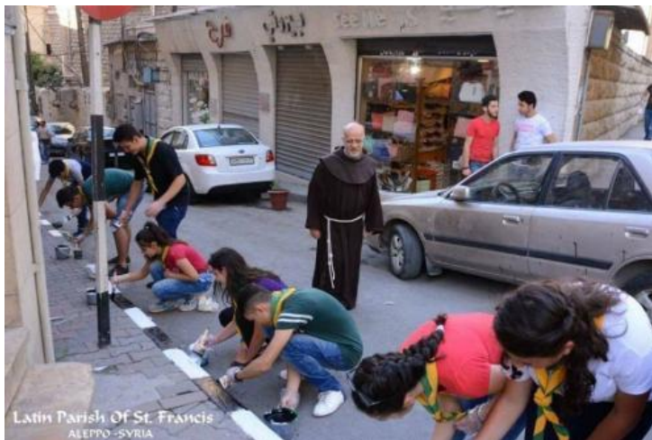
Rebuilding Aleppo, Summer 2017.

The answer is simple. The majority of Syrians, whether Sunni, Shia, Alawi, Christian, Kurd, or Ismaili, are sane individuals – they've seen what life is like under the “alternative” rebel rule marked by sharia courts, smoke and alcohol bans, public floggings, street executions, desecration of churches, and religious and ethnic cleansing of minorities. They recognize that there is a real Syrian national identity, and it goes beyond mere loyalty to the current ruling clique that happens to be in power, but in Syria as a pluralistic Levantine society that rejects Saudi style theocracy.