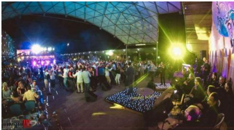
Outdoor concert venue and Aleppo springs back to life, Summer 2017

The fact remains that there are some popular figures in the establishment media and analyst community who speak and write frequently about Syria, and yet have never spent a significant amount of time in the country. Throughout much of the war they've primarily reported from Western capitals - thousands of miles away - or, if they are in a Middle East bureau, without ever leaving the safety of places like Beirut or Istanbul. Fewer still have the necessary Arabic language skills to keep pace with local and regional events. Some have never been to Syria at all. They become willing conduits of rebel propaganda beamed through WhatsApp messages and Skype interviews, which was especially the case when it came to the battle for Aleppo. That much of the world actually considers these people as authorities on what's happening in Syria is a joke – it's beyond absurd.