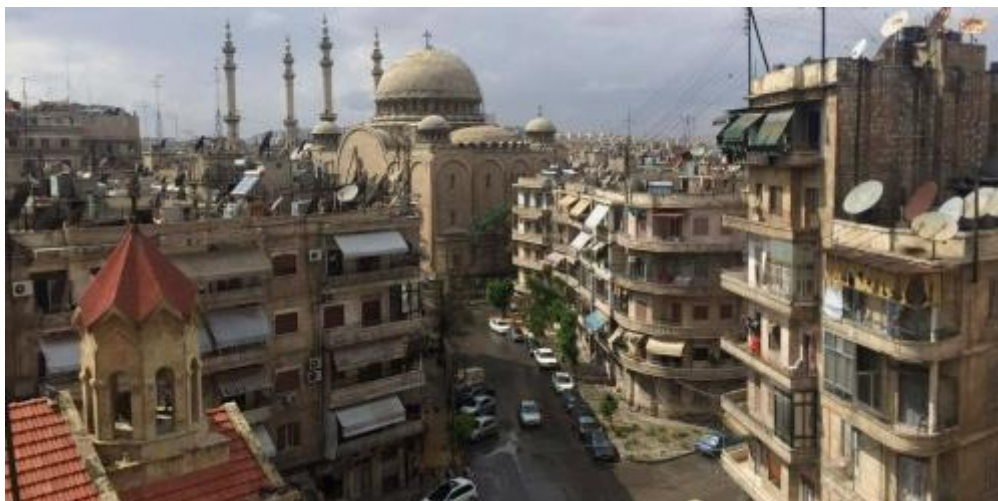
Al Aziziyah neighborhood in Aleppo

The Syrian Army and government were never "Shia" or sectarian-based