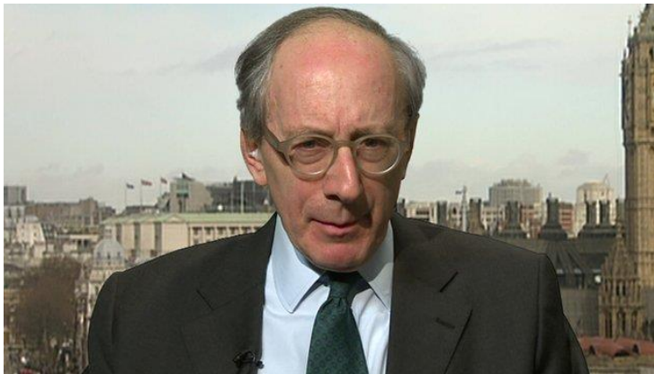
Deep-state defender Malcolm Rifkind

are of interest from the vast majority that are not. (What rubbish, Sir Simon! Our intelligence agencies are not outside the law, The Guardian, 20 th September, 2013)