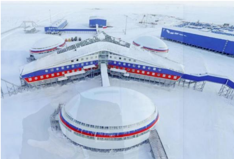
Russia's top-secret Trefoil military base in the Arctic Circle revealed for first time to West on 19 April 2017

motives in releasing the information about the full and devastating power of these new “ magrav technology ” weapons, and giving the Americans a lesson in Alaska of what will happen should war begin, is meant to dissuade the West from the insane course of global conflict it is currently on—but if not stopped, will see Federation aircraft from the top-secret Trefoil military base in the Arctic Circle descend upon the military might of the West and destroy it all in a matter of days, if not hours.